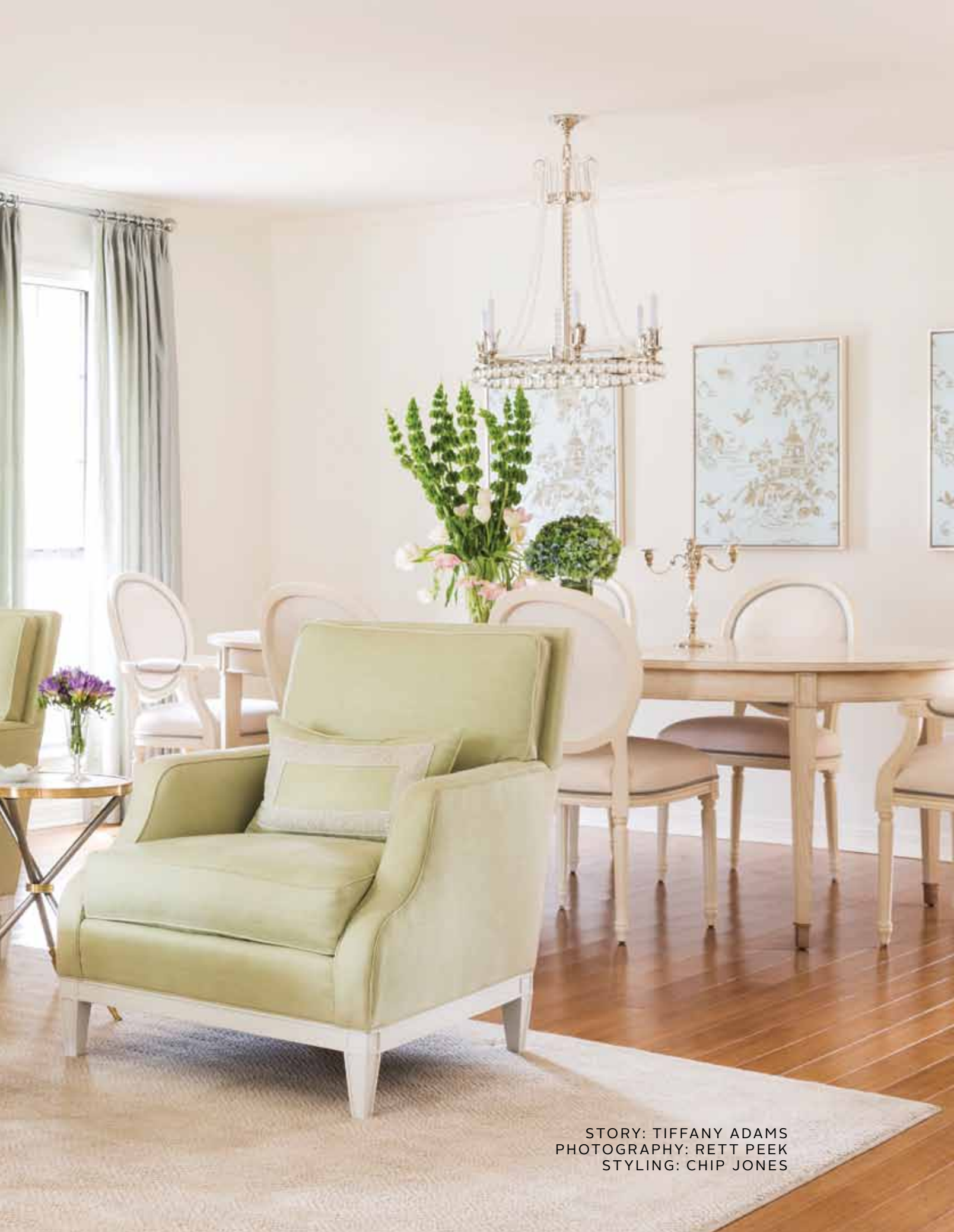
STORY: TIFFANY ADAMS STYLING: CHIP JONES